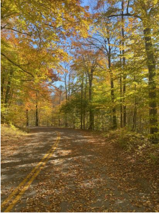
Beautiful fall colors in Genesee County Park.