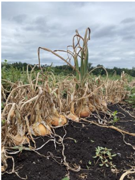
Onions on the Muck!