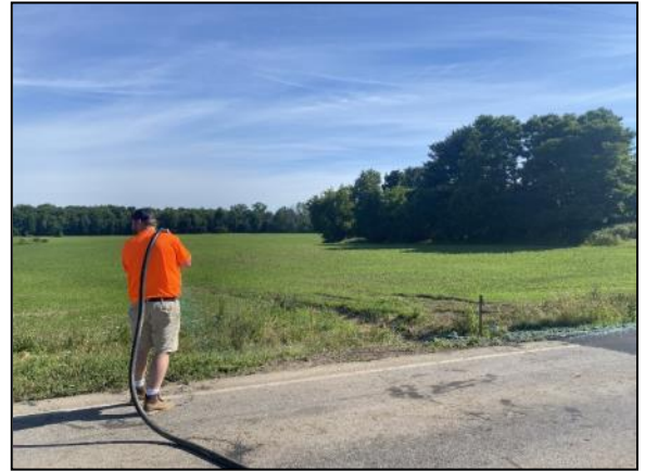
Figure 3: Technician Tim hard at work hydroseeding!

seven (7) towns, the county highway, and the county park. As a District, we have officially seeded over triple the acreage since 2022! We hope to continue furthering these relationships and keep increasing our total seeded acreage for next year!