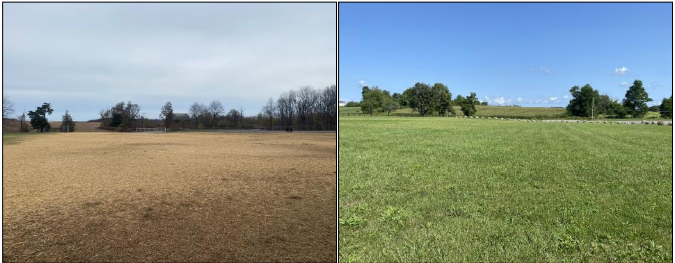
Figure 1: Before (left) & After (right) of a town parks transition from a Waste Transfer Station to now grassed field for public recreation