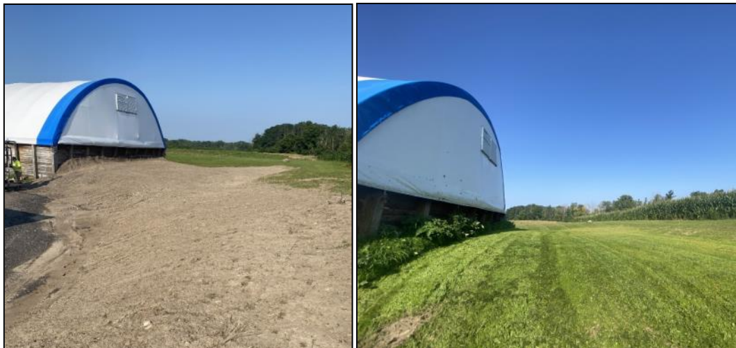
Figure 2: Before (left) & After (right) of hydroseeding newly graded soil to divert water from the towns salt