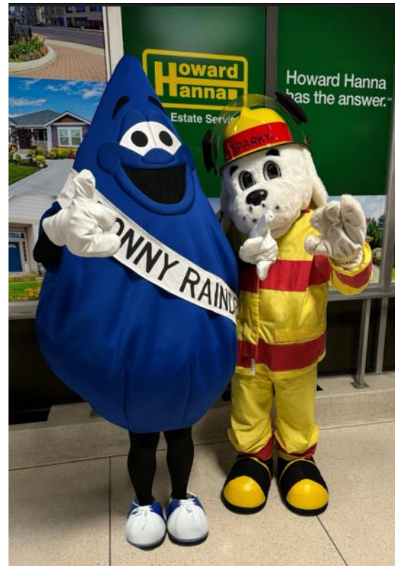
Ronny Raindrop® participated at a Utica Comets Trick- or-Treat at the Nexus Center. He is with Sparky the Fire dog, the Utica Fire Department's mascot.

Santa Ronny Raindrop® toured Suffolk County.