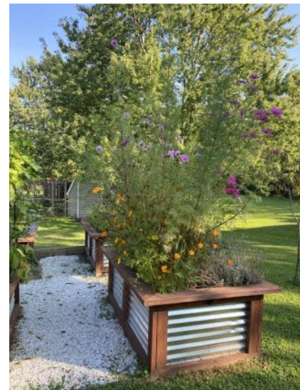
Native Flowering seeds from our Tree & Shrub Program in my parent's garden bed! I think next year they'll plant them somewhere my mom can reach!