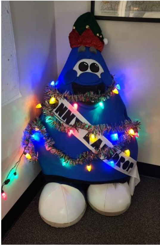
Ronny Raindrop® was decked in festive lights, garland, and elf hat for the holiday season at the Schoharie County Soil & Water Conservation District.

Please note: black pants and a black long sleeved shirt must be worn with the costume.